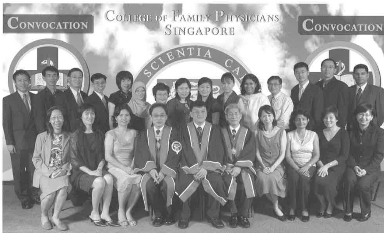
GDFM graduands and College council members