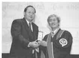
Dr Tan See Leng