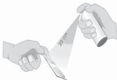
Figure 4. Fixation of the smear with spray

The fixative of choice is 95% ethyl alcohol but other appropriate fixatives may be used. The smear should be sprayed with an aerosol fixative (Fig 4). It should be fix immediately by spraying at a right angle from a distance of 20 cm. If closer, the cells are blown away or frozen, if on a slant, the material is blown into aggregates. Avoid droplet formation: so do not use too much fixative. A very fast fixation, within a few seconds, is essential to prevent drying artefacts.