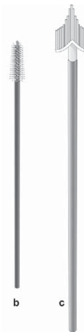
Figure 1. Sampling devices: b. endocervical brush; c. cervical broom

The precursors of cervical cancer arise mainly in the transformation zone. This is the area between the squamous epithelium and the columnar epithelium. It is composed of columnar epithelium which has descended on to the ectocervix. Subsequently, this columnar epithelium metaplastes to a varying degree to squamous epithelium. This process exposes it to neoplastic transformation. Thus, it is important that cell material be sampled primarily from this zone. Sampling the transformation zone may be carried out using a cervical broom (Cervex-Brush®). The endocervical canal can be sampled using the endocervical brush (Cytobrush®) (Fig 1).